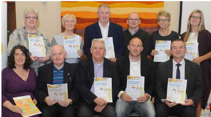
Launch of health & wellbeing bulletin in English & six major languages at the Connecting For Life conference in Gweedore on Friday 6th October.